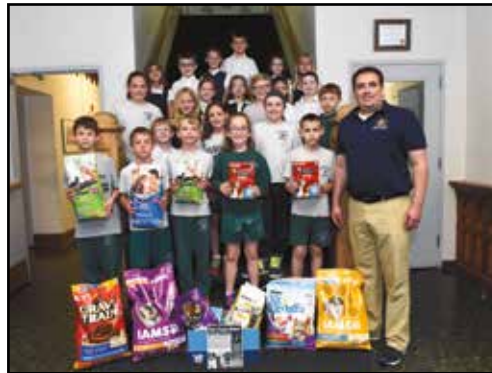
Forest Hills Elementary School