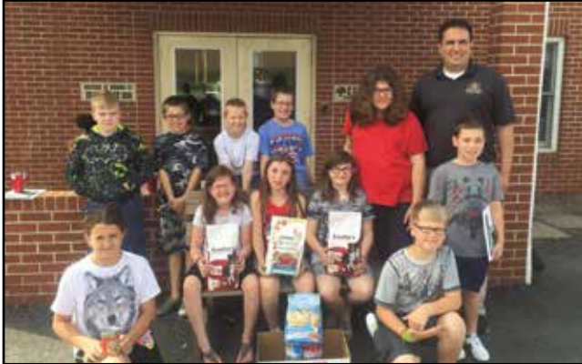
Cambria County Christian School